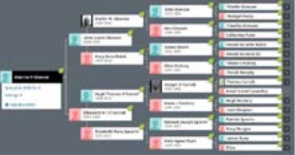
A screenshot of a basic pedigree chart. This is all you need to send in an initial message to your match with the question: any common locations, surnames or people?

But you don't need to have an online tree if you don't want to. All you really need to compare with your match is a pedigree diagram or ancestral chart. A pdf version or even a photo of a paper and pencil version is easy to attach to an email to your match and is a great way of starting a conversation.